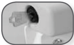
Key lock (optional)