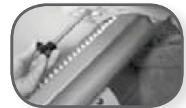
Manual hand crank