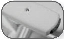
LED indicator light