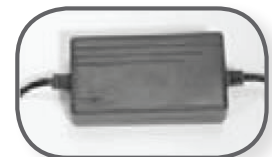
Charger (located at one end of the rail)